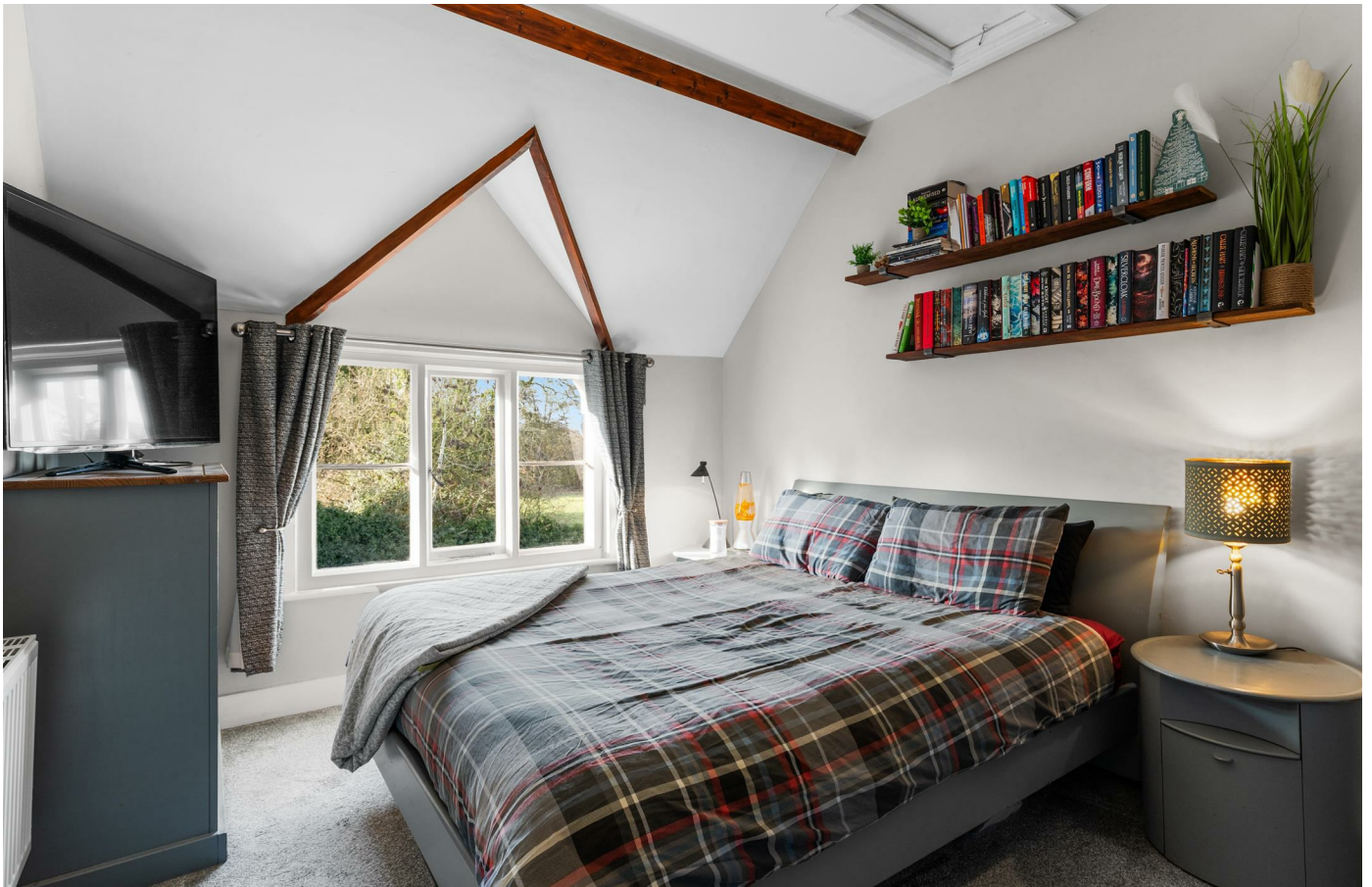
Troop Cottage, 27 Vicarage Lane, Sherbourne, Warwick, CV35 8AP